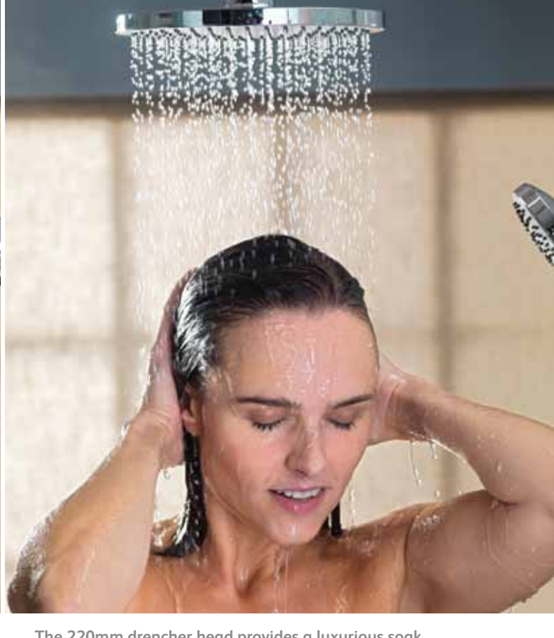
The adjustable height handset