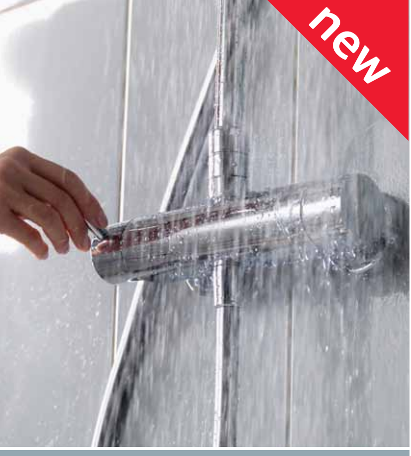
Exposed thermostatic bar valve with integrated diverter, flow and temperature control